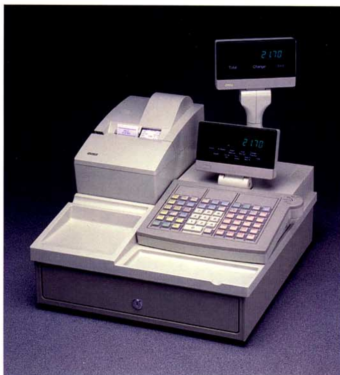
Another popular compact arrangement of the NCR 2170 is this unified version.