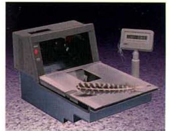
NCR's hand-held scanners and scanner/scales can be utilized with the 2170 Retail Terminals. Each 2170 Terminal may be configured with two scanners.