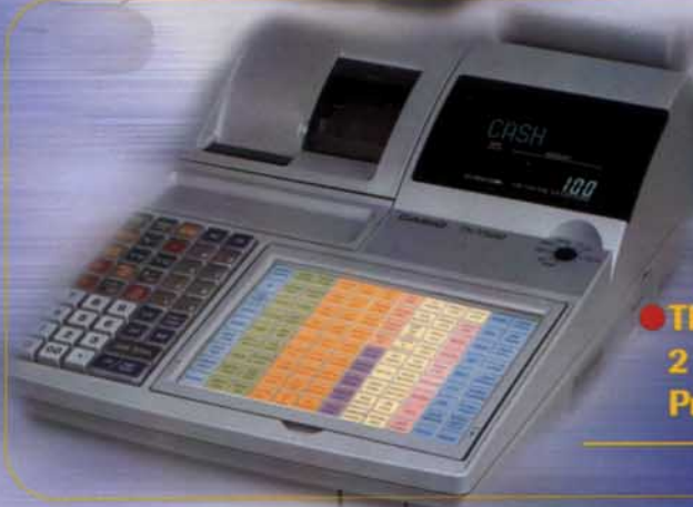
TK-T500 2 station Thermal Printer Model